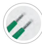
19 mm Schuko clearance with IP2X/GS38 contact protection