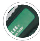
IP65 – dust tight and low pressure waterproof