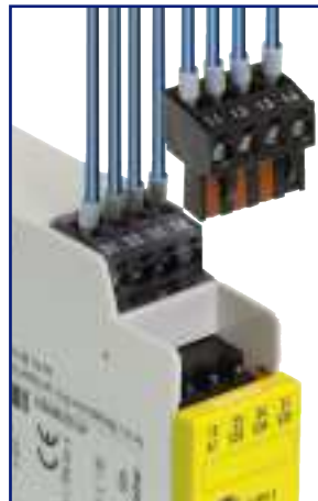
Screw type terminal, pluggable (-A)