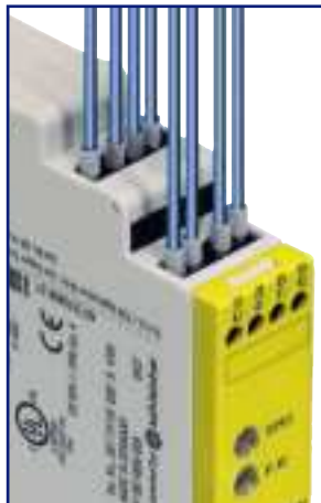
Terminal block, fixed