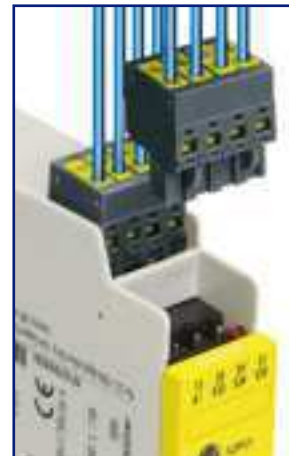
Spring-loaded terminal, pluggable (-C)