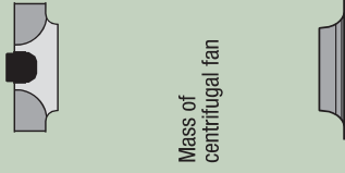
Mass of centrifugal fan