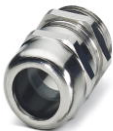
Cable gland, Cable gland material: Nickel-plated brass, External cable diameter 6 mm ... 12 mm, Shielding: No, Connecting thread: M20, Color: silver

Please be informed that the data shown in this PDF Document is generated from our Online Catalog. Please find the complete data in the user's documentation. Our General Terms of Use for Downloads are valid ( http://phoenixcontact.com/download )