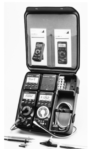
F840 (with sample contents)