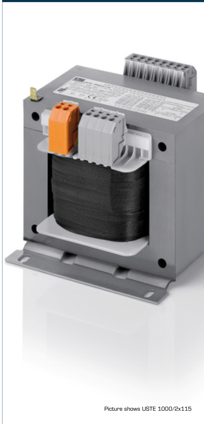
Picture shows USTE 1000/2x115