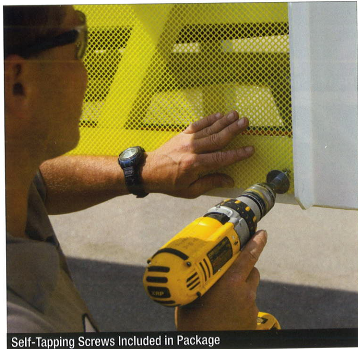
Self-Tapping Screws Included in Package

1-800-321-1558 Find local distribution at superior-ind.com/distributor © 2012 Superior Industries CL-119