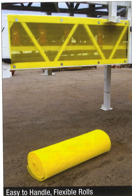
Easy to Handle, Flexible Rolls