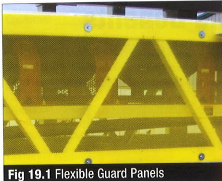
Fig 19.1 Flexible Guard Panels