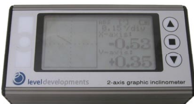
Bottom Face - 2 axis mode

The LD-2M will switch mode automatically depending on which face it is placed. The range of measurement is ±30° in each mode.