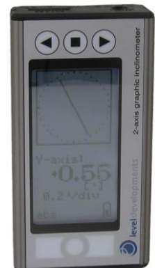
Vertical Edge - Y axis mode